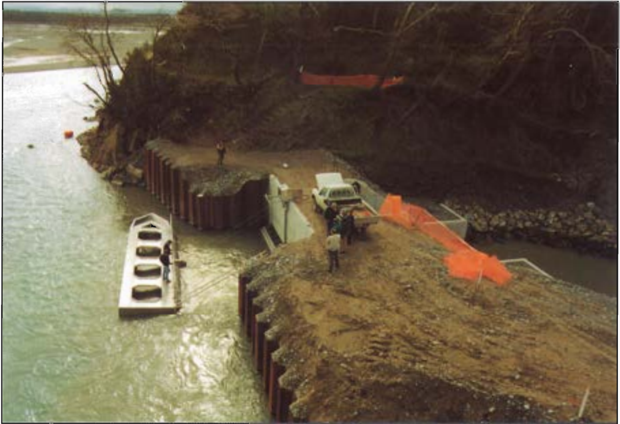
The “Boat” (intake and fish screen combined) during commissioning. August 1999