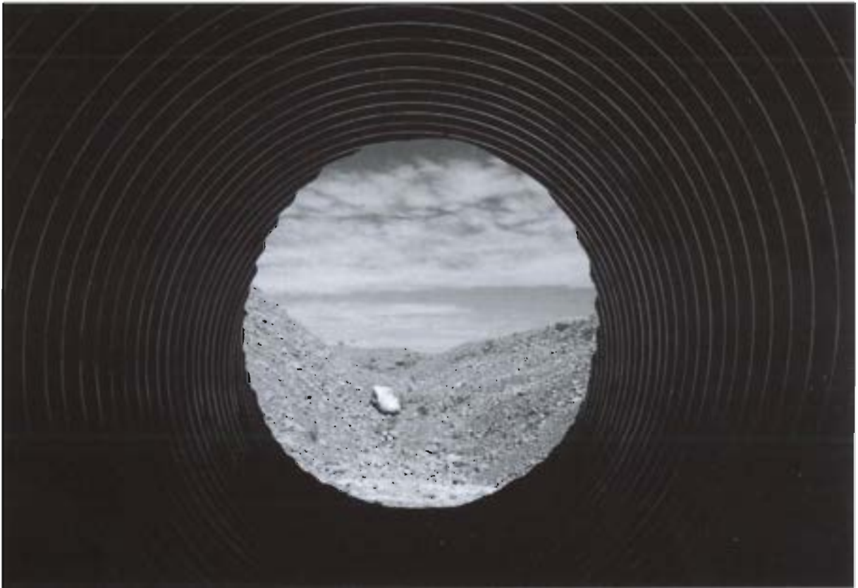
Through the culvert.