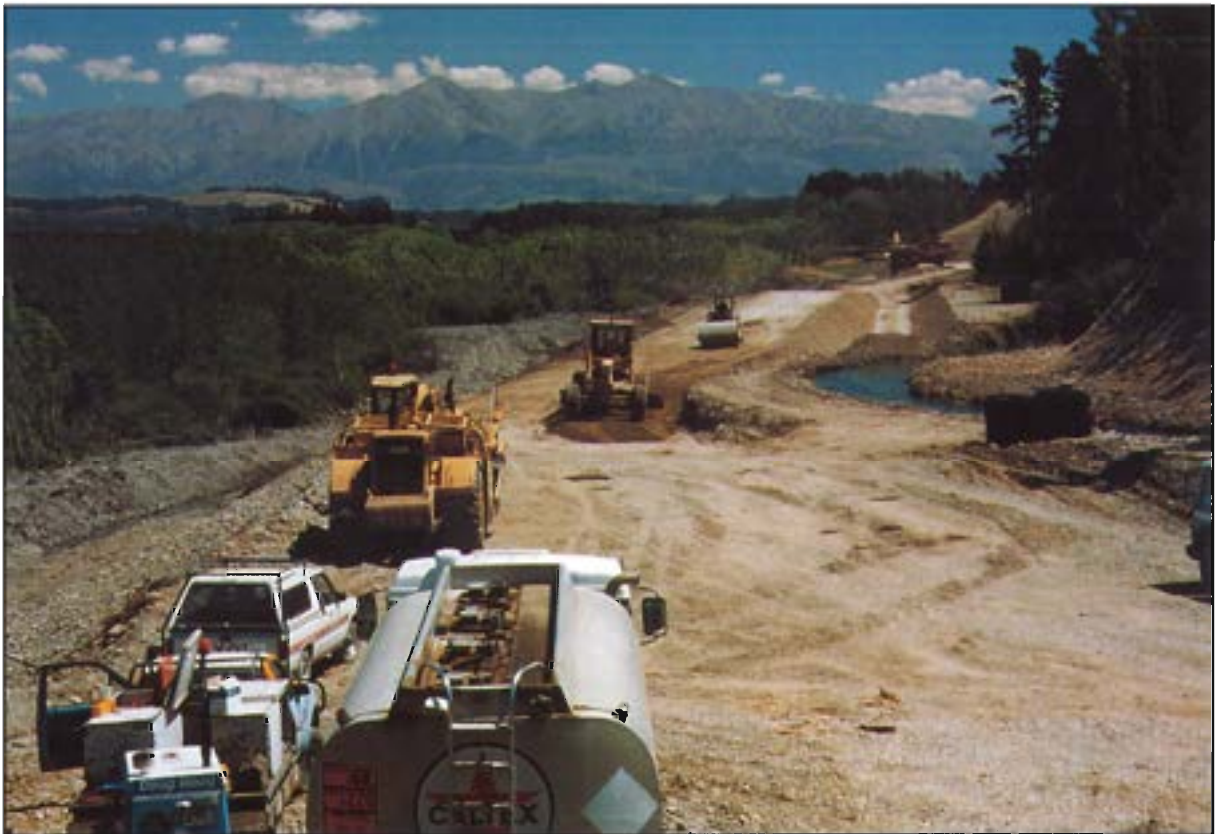
Compaction of the wide buttress near the top of the terrace. Note the existing stock water race at right. January 1999