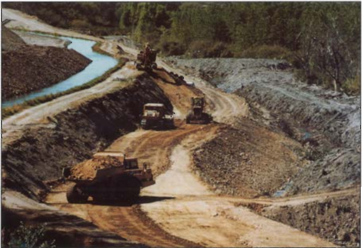
Existing water race and access track. Note that the swamp at the toe of the slope has been excavated down to river gravels in order to give a good bedding for the buttress material. February 1999