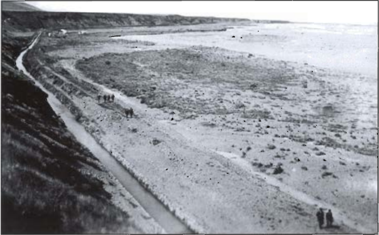
A view of the water race from Brown's Rock, looking downstream. The race can be seen making its way along the side of the terrace in the far distance. 21st November 1923.