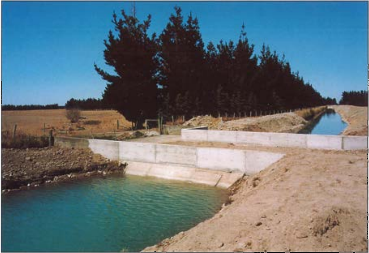
New bridge on the main race. January 1999