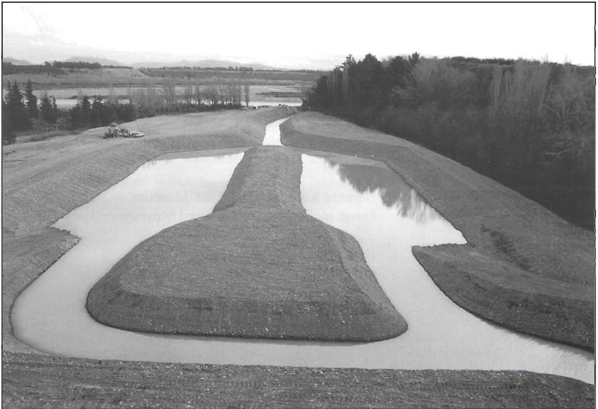
The silt ponds are designed so that water continues to flow on one side when the other is closed off for cleaning. August 1999