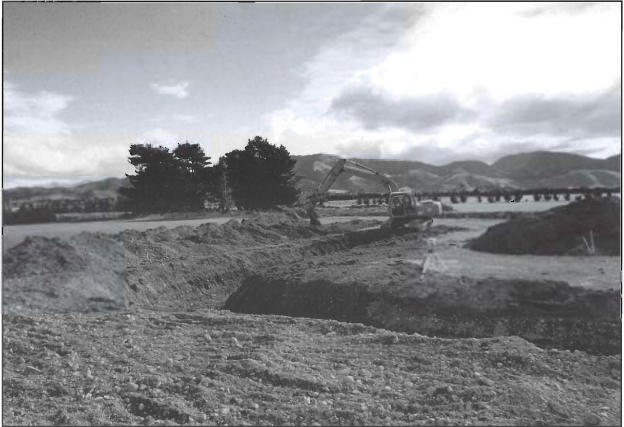
Realignment of Main Race.