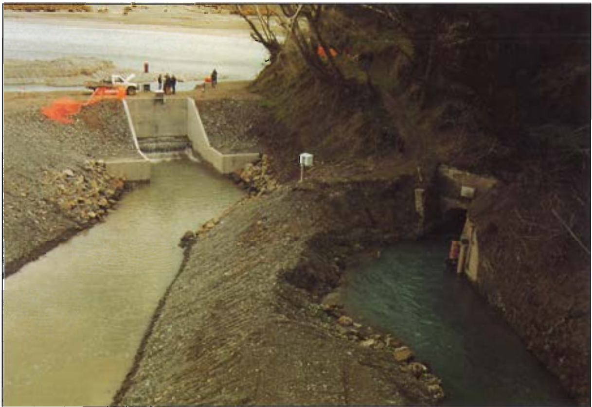
The new intake and the old tunnel (note the commemorative plaque). This tunnel is now registered as an “Historic Place”. August 1999