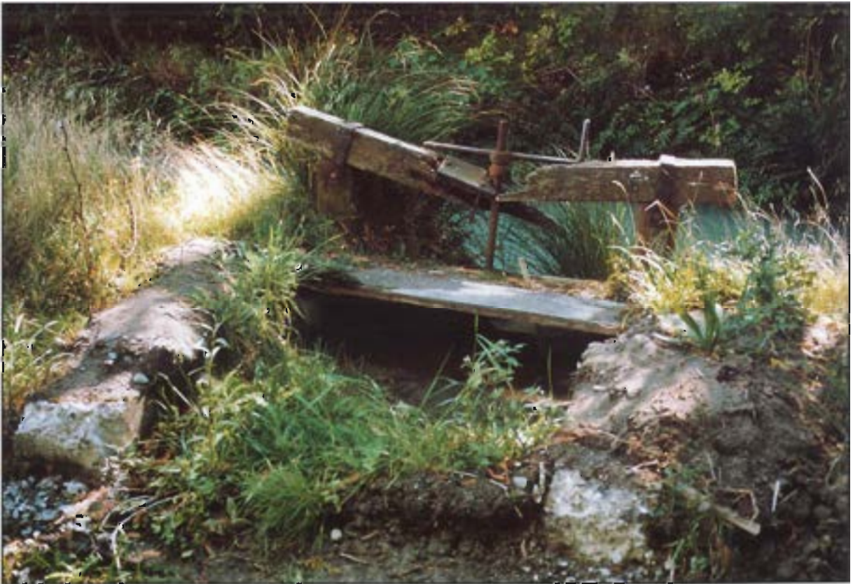
The remains of an old control gate near the intake. March 1999