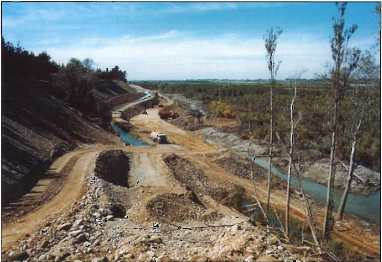
Forming the new buttress along the terrace. Note how the use of long metal pipes allowed construction to be carried out beside and over the fully operational existing water race. February 1999