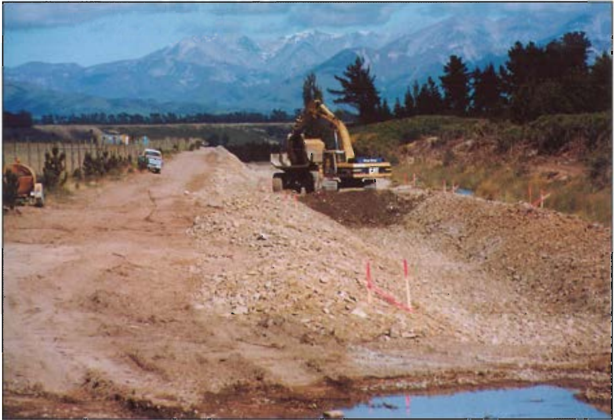
Main Race with the Torlesse Range in the background. This photo is taken looking west up the race towards the Waimakariri River. December 1998