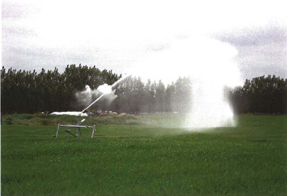
Figure 3.2: Gun Irrigator

This has the same application rate as a Rotorainer. It is easier to shift but the watering pattern can be greatly affected by wind and requires a higher water pressure to operate than the Rotorainer. This system was not chosen as it was considered to be less efficient.