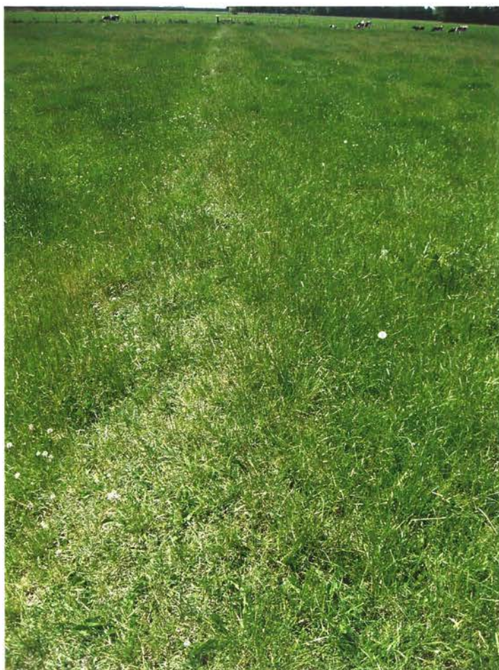
Figure 5.1: Top of a border

There were 108,700 meters of borders each having an area on the top of the border which dried out and grew poorer grasses and weeds. On average these dry areas are 400mm wide and would cover 4.35 ha in total.