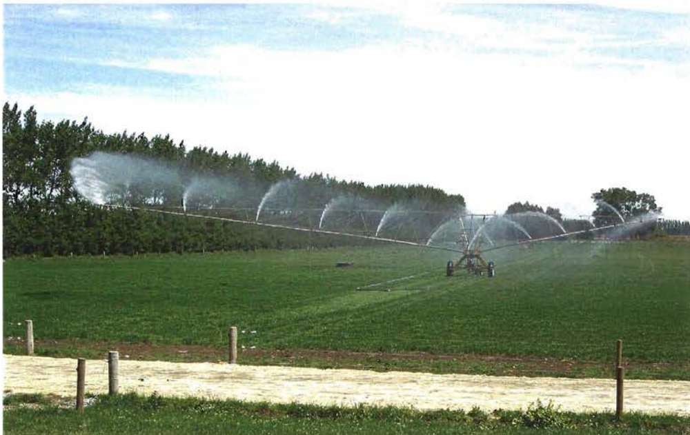
Figure 3.1: Rotorainer Irrigator

This would apply 50 mm of water every 14 days .This would require daily shifts to irrigate 100m wide strips up to 600m long and requires medium water pressure to operate.