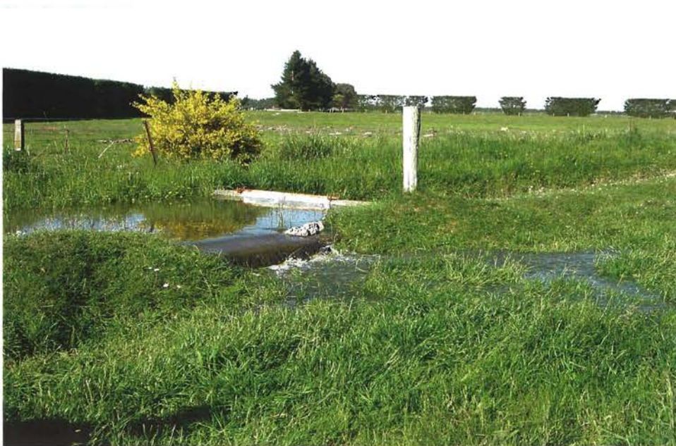
Figure 2.1: Border-dyke irrigation.