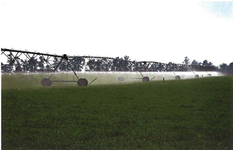
Figure 3.3: Centre Pivot

This can apply between 5mm and 80mm of water. This machine is self propelled around a pivot point therefore no labour is required for daily moving. A pivot operates under low water pressure and is recognised as having a high watering efficiency. Due to the circular pattern of irrigation corners are not irrigated and therefore require the installation of small sprinklers.