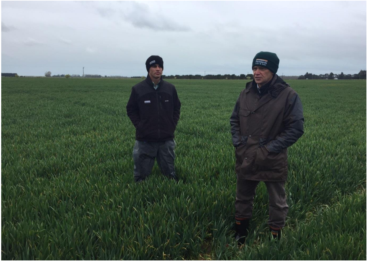
Figure 8 Walking the paddocks and staff training