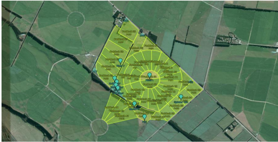
Figure 6 Production Wise Paddock Map