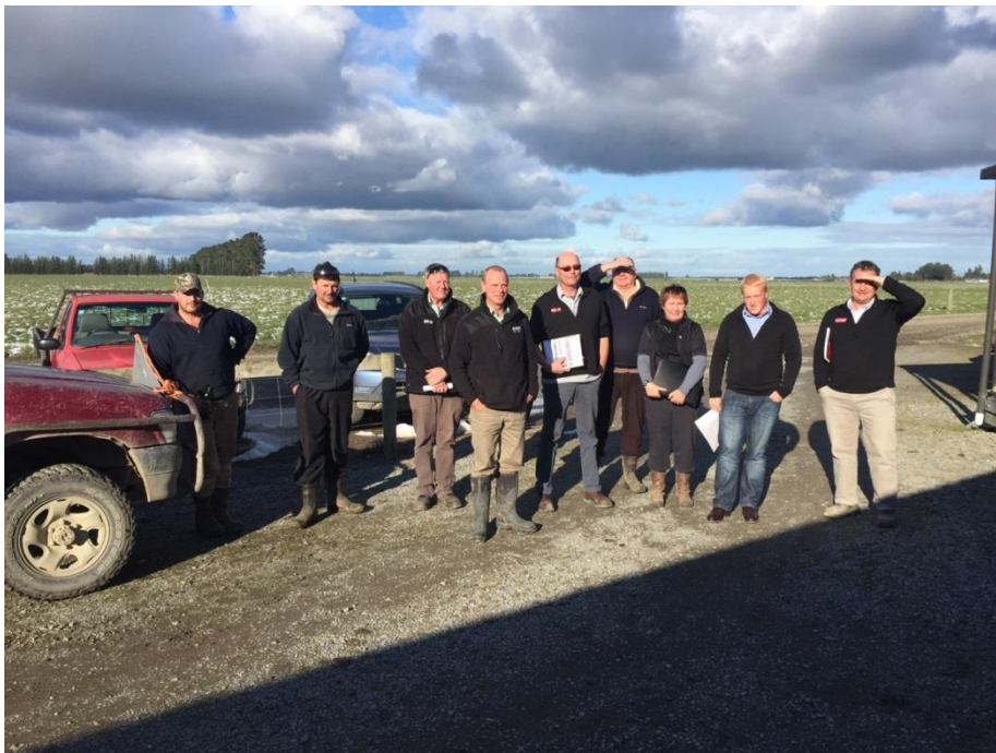
Figure 7 Canterbury Grasslands and Contractors Team

CGL will continue to use the Production Wise method of paddock recording across all their farms, and I will encourage and assist them where and whenever needed.