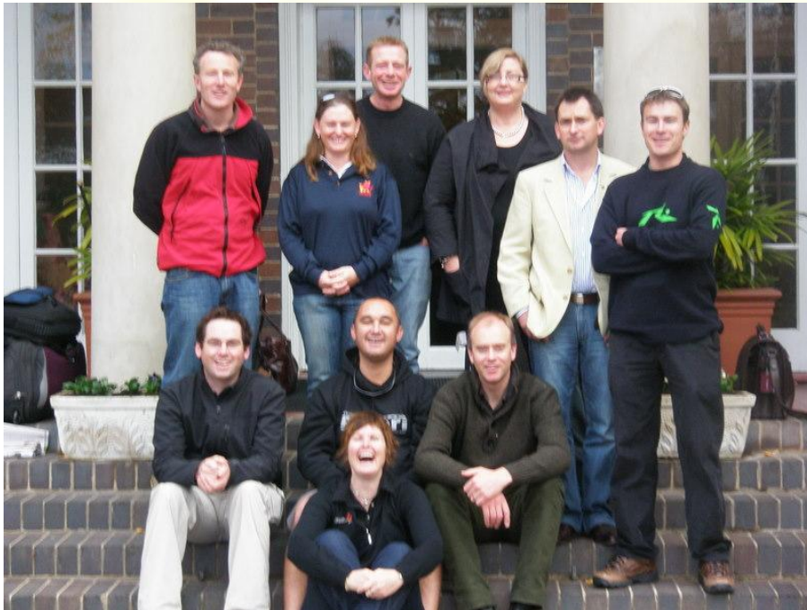
Figure 1: Global Focus Team Two 2009. Canberra