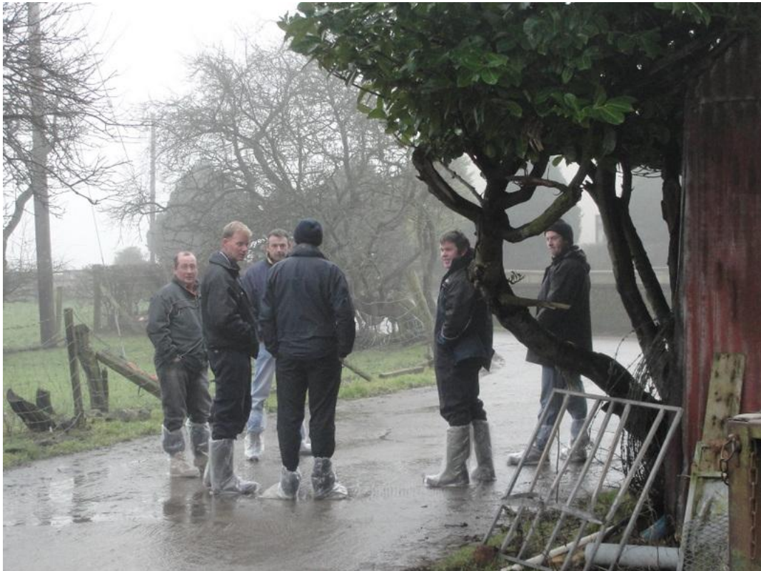
Figure 7: Bio-security on-farm is taken seriously in Northern Ireland