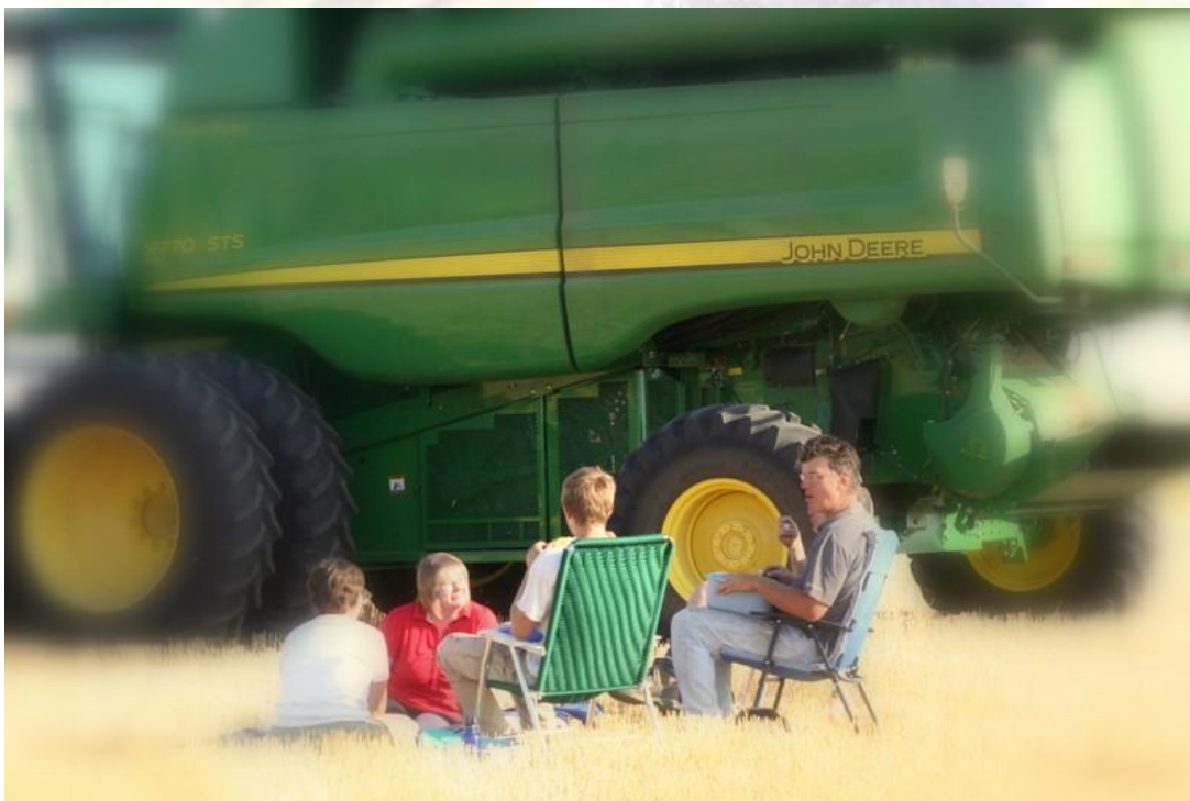
Figure 8: Family Business Continuance and Succession Planning must take into account the personal and management aspects of the family business