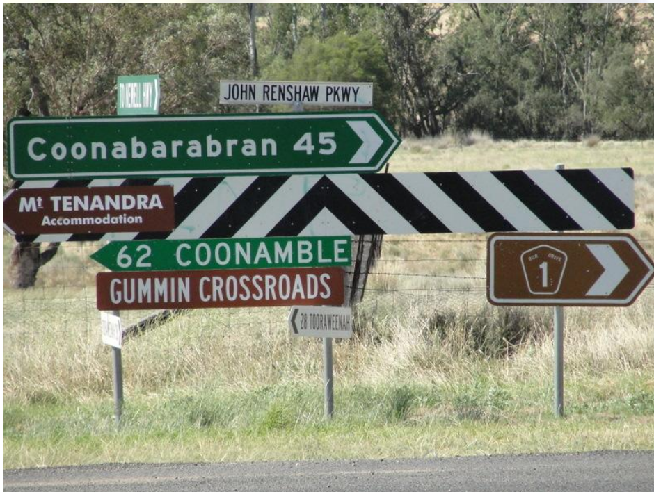
Figure 2: Knowing where you are going is vital when life gives you many alternatives