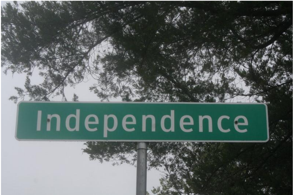
Figure 9: AT the end of the day; this is what we all want