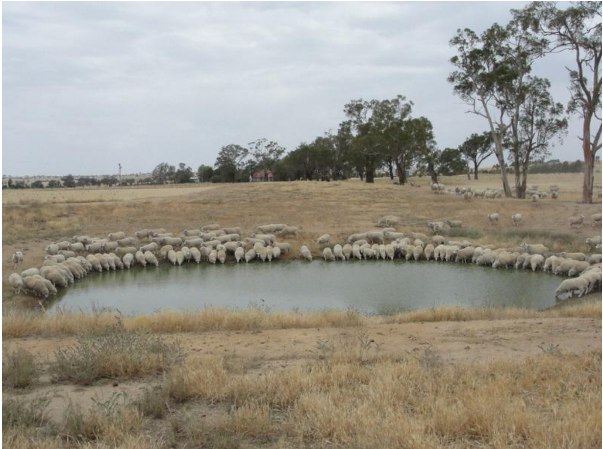
Figure 5: Water is vital to life on this planet