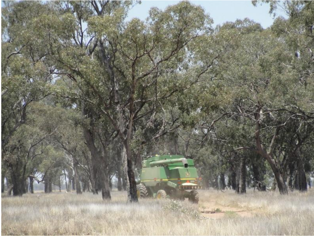
Figure 3: Australians faced with low rainfall climates seek innovations to improve production reliability and yield