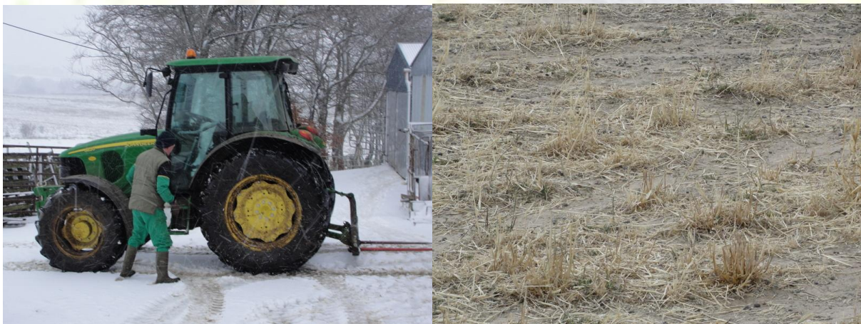
Figure 6: Farmers content with the weather wherever they are