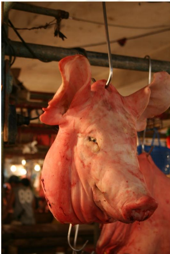
Figure 4: People have different perceptions of what is 'food'